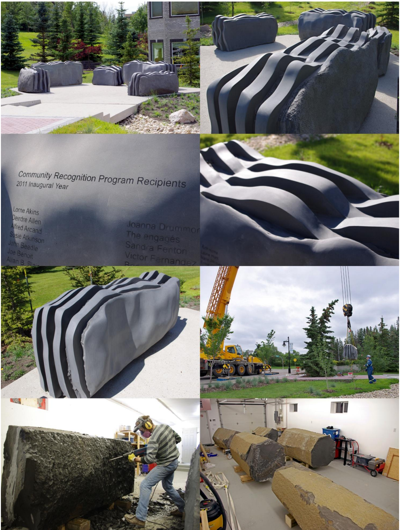
Time is a River: St. Albert's Community Recognition Project, 2010 - 2011 (site view, details, installation, carving process, studio). Five basalt columns, approx. 6,000 to 8,000 lbs. each, approx. 96" x 32" x 40" each; installed size approx. 30' diameter x 40" high; installed mass approx. 20 tons.