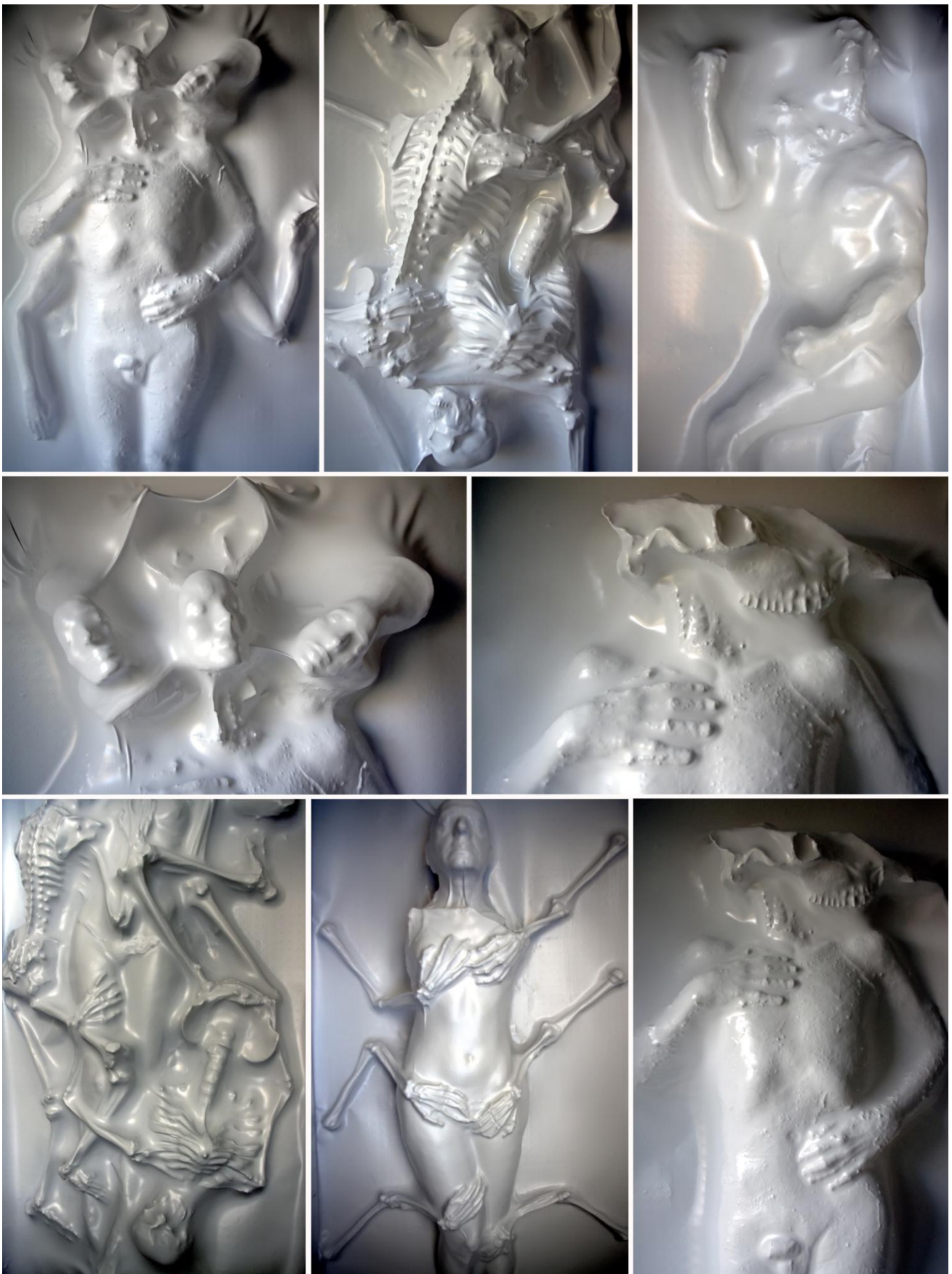
Grim Indulgences (details), 2018. Twelve wall-relief sculptures made of high-impact polystyrene; each one measuring 96" x 48" x 12" deep. ( Click here to see more images and read the Artist's Statement about this collaborative performance-art installation. )