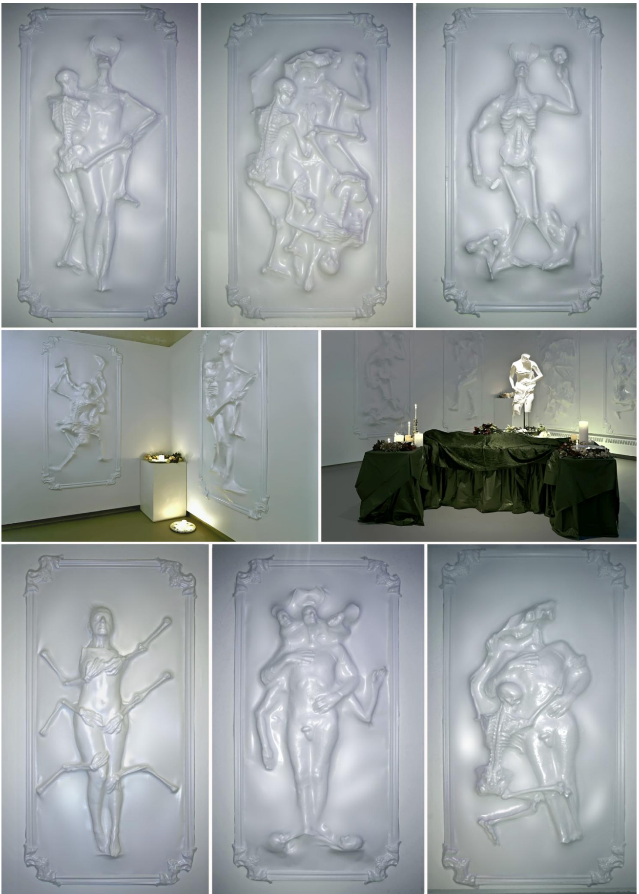
Grim Indulgences (installed view), 2018. Twelve wall relief sculptures made of high-impact polystyrene; each one measuring 96" x 48" x 12" deep.