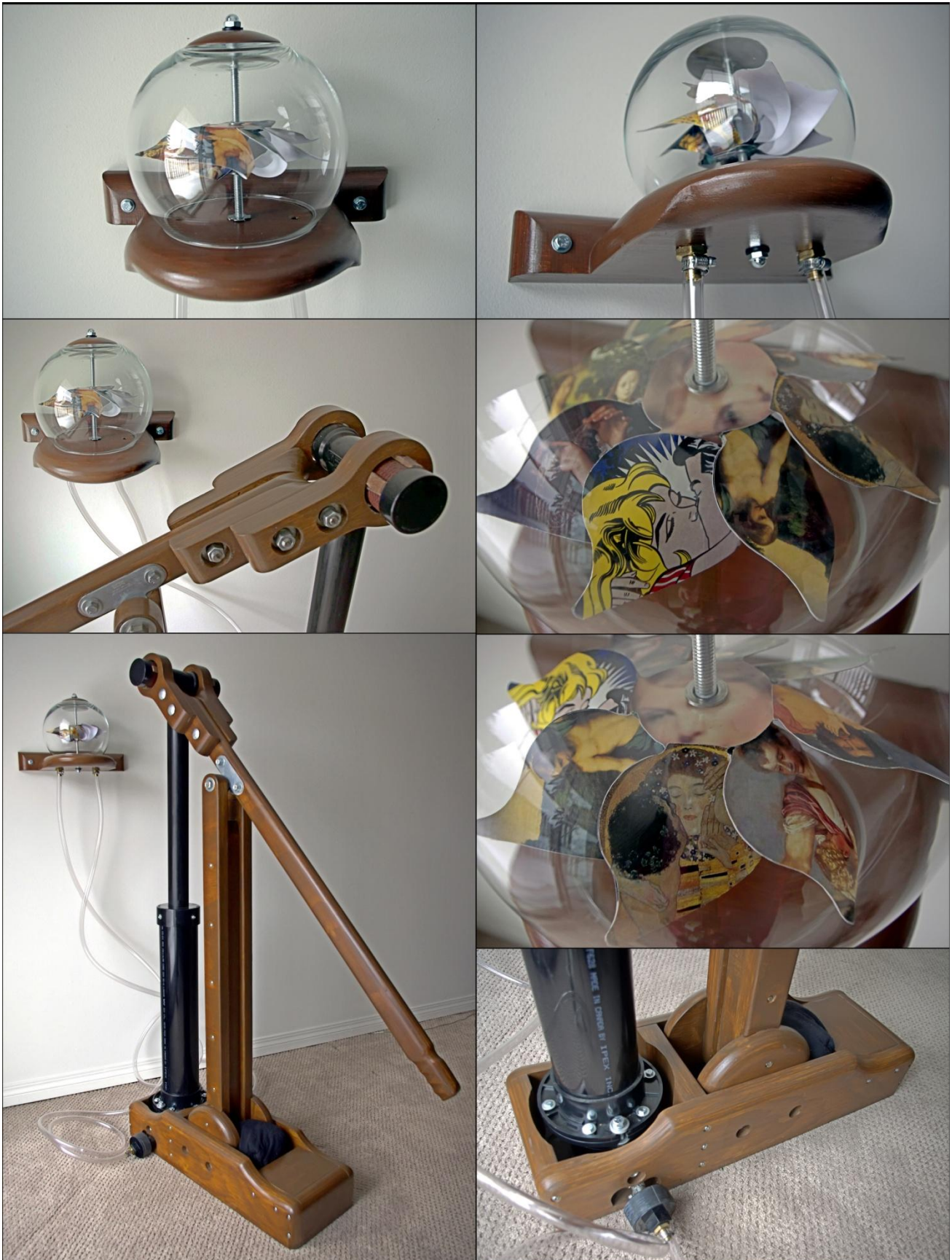
I Loved Her Because She Loved Me Because I Loved Her... , 2016 (installed view and details): wood, metal, plastic, glass, acrylic, ink-jet printed images; 10" x 28" x 72" high. To see a live-action video of this artwork, point your browser to http://www.functionalstone.com/interactive/index.html