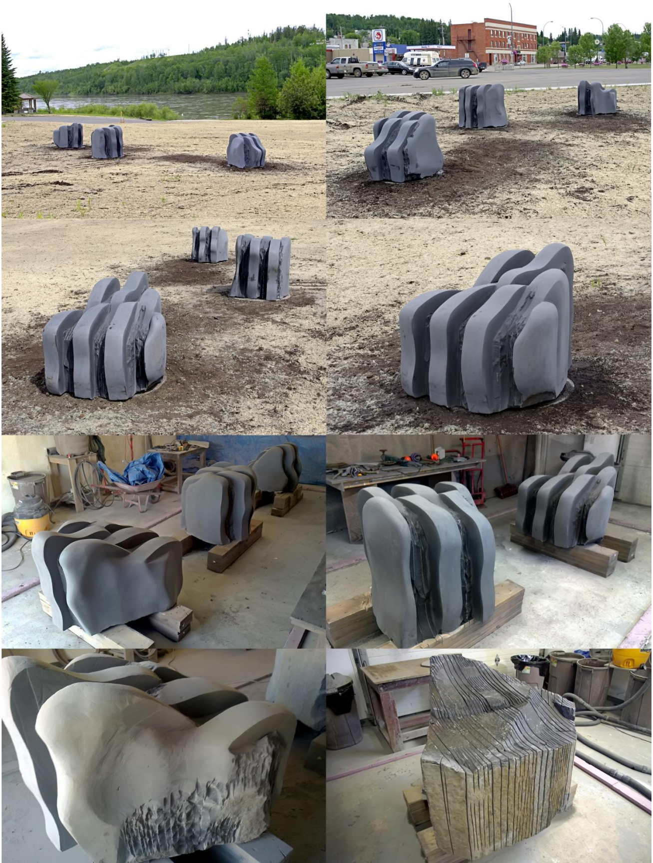
Turned by a Pebble's Edge: Athabasca's Centennial Commemorative Project , 2012 (site view, details, carving process, studio). Three basalt columns, approx. 3,000 to 4,000 lbs. each, approx. 36" x 36" x 36" each, installed size approx. 40' diameter x 36" high; installed mass approx. 6 tons.