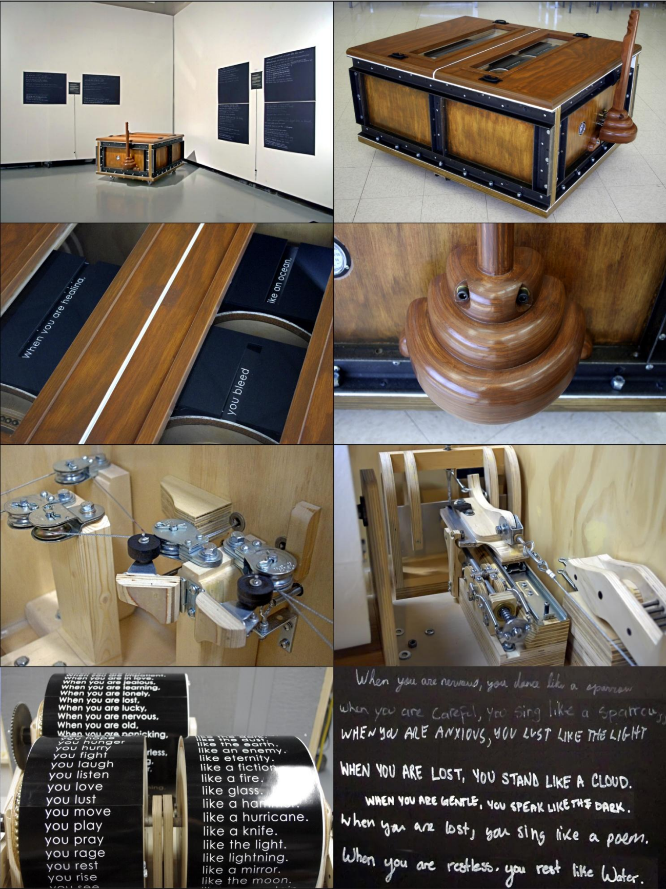
Introspection Machine , 2017 (installed view and details, with written-text by viewers at lower right): wood, metal, plastic, acrylic, ink-jet printed text; 42" x 60" x 24" high. To see a live-action video of this artwork, point your browser to http://www.functionalstone.com/interactive/index.html