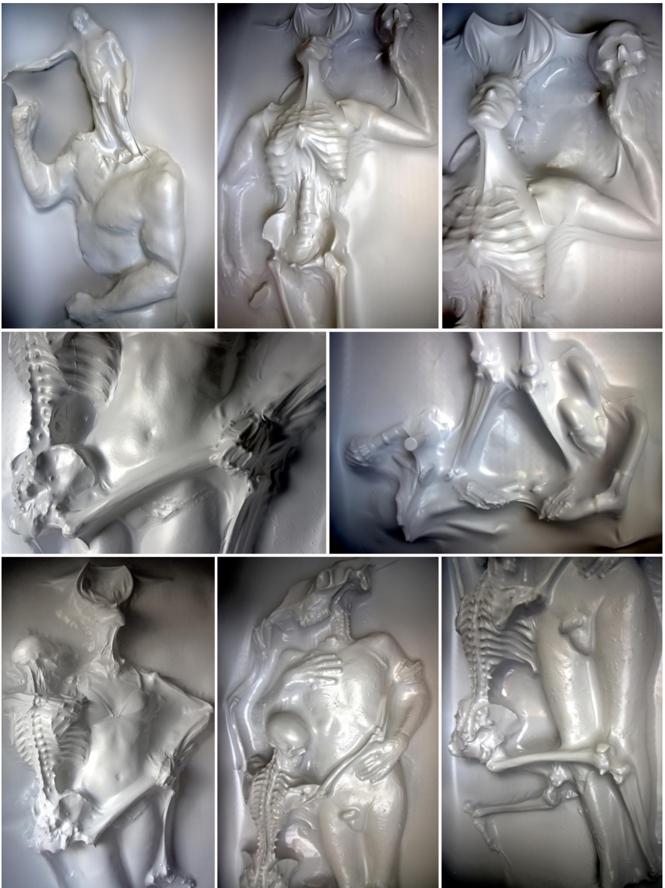
Grim Indulgences (details), 2018. Twelve wall-relief sculptures made of high-impact polystyrene; each one measuring approx. 96" x 48" x 12" deep.