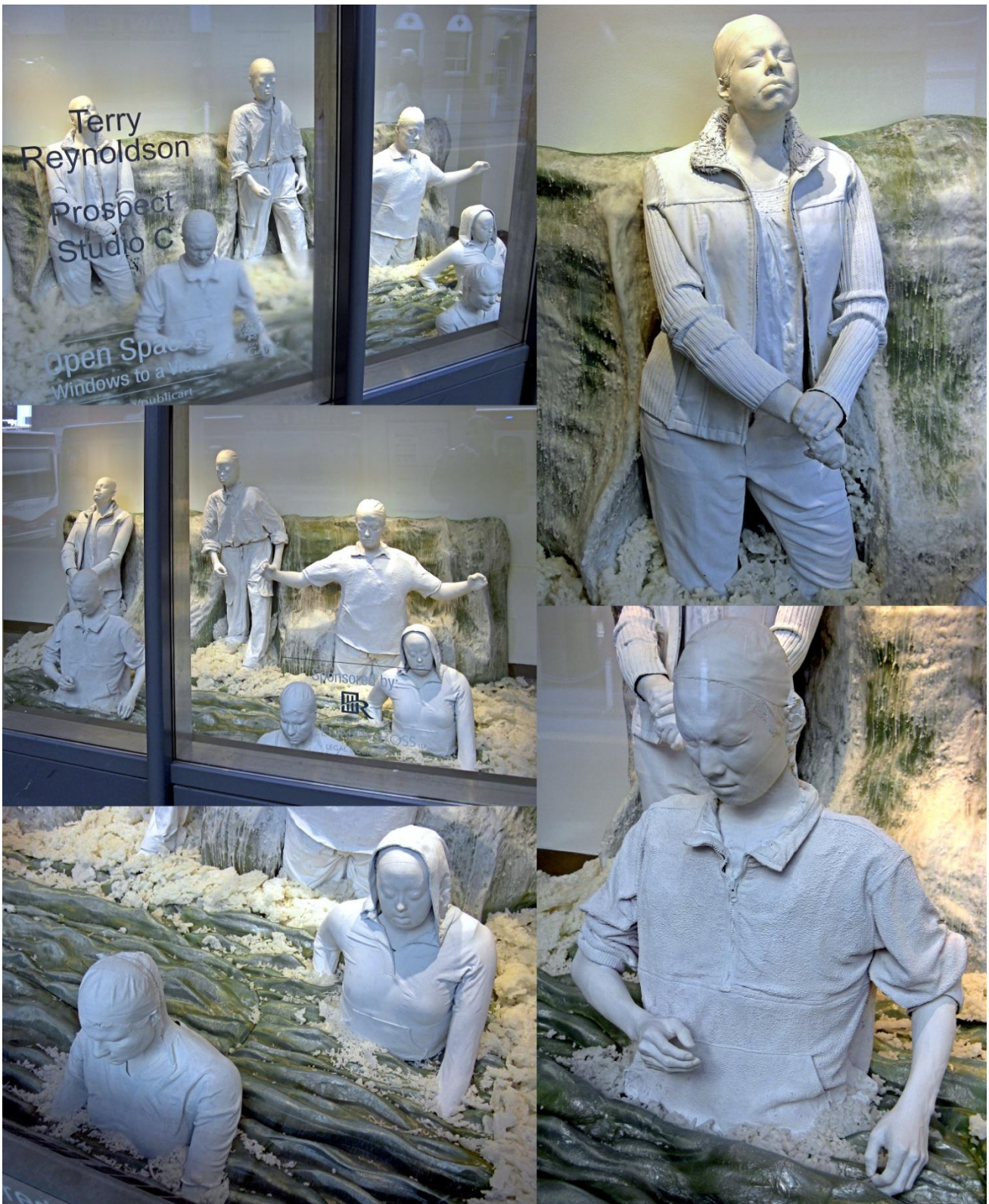
Rush Hour , 2011 (installation view and details of a collaborative artwork with Prospect Human Services and Studio C, installed at Open Spaces, Calgary): plaster, wax, fabric, metal; life-size.

NEXT PAGE (from upper left to lower right): Have Lawn, Will Travel: Great Expectations; Keeping Up Appearances; Parking It; Working for the Weekend; Love is All You Need?!; Potluck; Games of Chance and Strategy; Home is Where Your Lawn Is. May to September, 1996 (stills from eight of fourteen performance-art installations, on sites throughout Calgary, Alberta, Canada. Sod, wood, various objects, variable dimensions from 8' x 5' x 1' high - 12' x 10.5' x 1' high